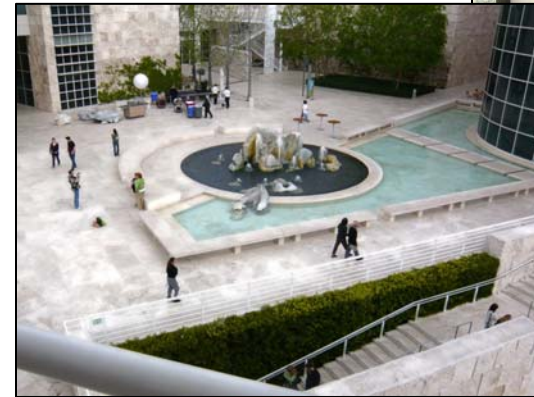
Above: The Getty Museum

Academy Library. The other course, half-unit, continues a ten-year tradition of an undergraduate conference whereby the students present graduate school level papers to an audience of professionals, the internship providers, alumni and former participants of the program now working in LA. These papers are also published in an online journal which the students put together.