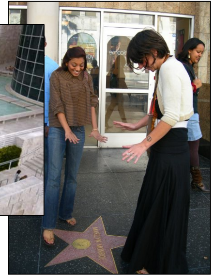
Right: The Walk of Fame